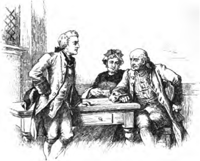
'Private negotiation with the parents.'